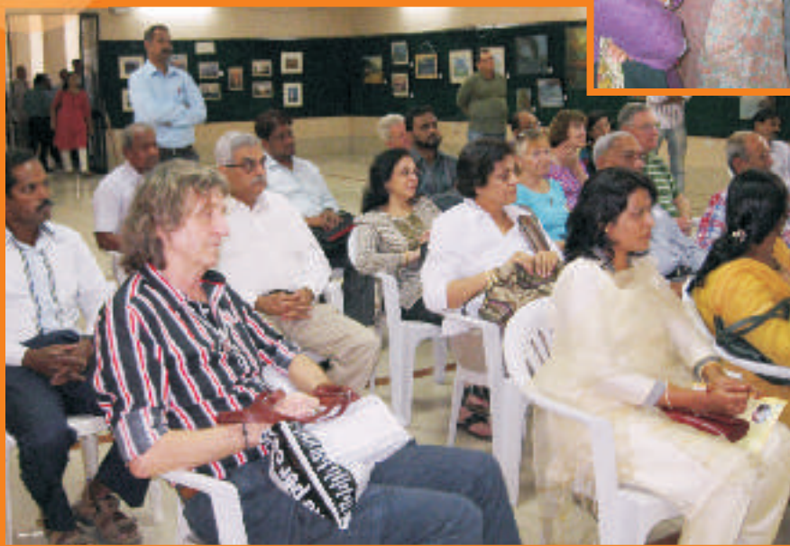
The audience listens in rapt attention