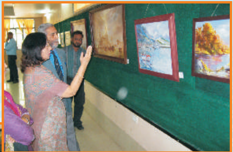
Chief Guest admiring the paintings on display