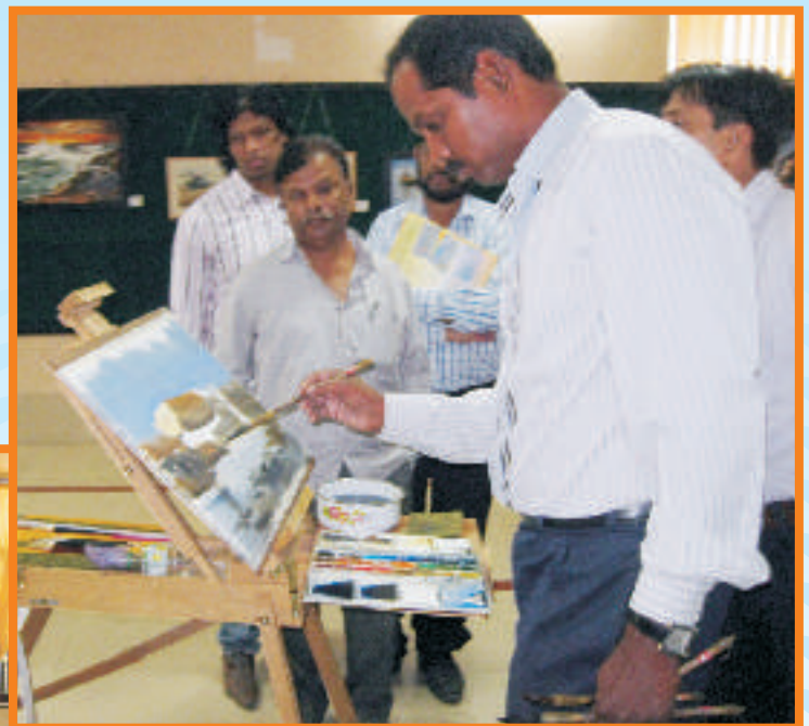
Live demo of Seascape by Mohan Jadhav