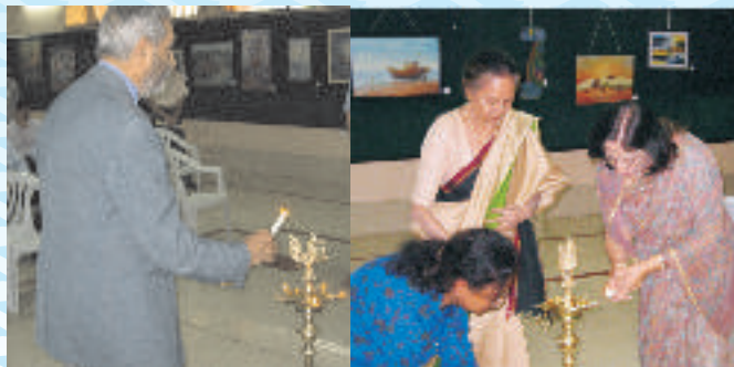
Chief Guest and Cmde. Vir light the lamp.